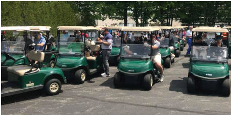
MDA Golf Scramble at Sable Oaks - p. 7