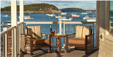
2019 MDA Annual Convention - p. 8