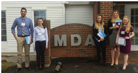
UNE Dental Students - see p. 9